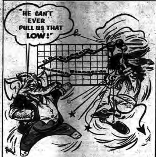
DEMS .... WE GOTTA' EQUAL RUSSIA!