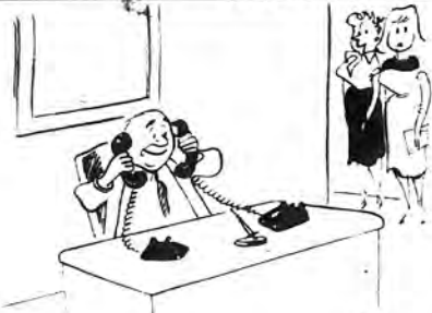
"The Telephone Company put in stereo for him"