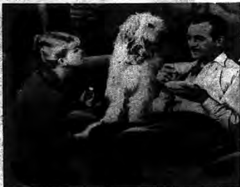
HOBO, the family ghoul, listens in on a discussion between Doris Day and David Niven in "Please Don't Eat the Daisies" now playing at Century's Plainview Theatre.

and Presenting HALEY HILLS as Pollyanna plus - Disney's MATURES - STRANGERS - CREATURES