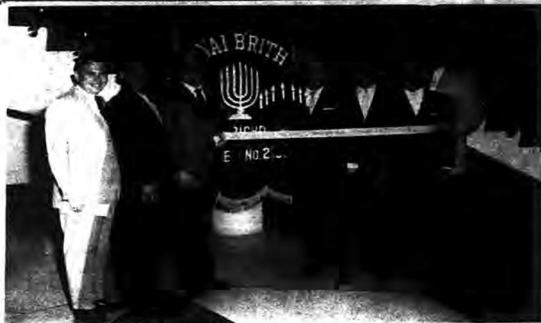
JERICO LODGE, B'nai Brith, earned the "District Membership Award" for the Lodge attaining the greatest net increase during the year. The presentation was made at the meeting attended by delegates from 350 lodges in District 1, comprising New York State and Central New England. The District includes 64 lodges in Nassau and Suffolk. The National Merit, Membership award