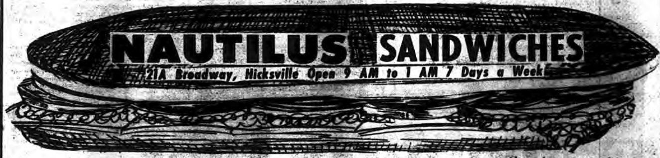
Almost, but not quite, life-size.

will be on display and can be tested from 9 AM to 1 AM starting Saturday, July 2 at 21 A Broadway (near E. Barclay St.) Hicksville