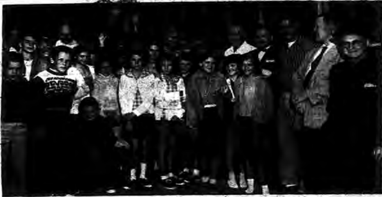
BUS LOAD of youngsters left from Nicholas St. School on Saturday for a vacation stay at Kamp Kiwanis out in Suffolk County as the annual guests of the Hicksville Kiwanis Club. This is one of the many youth programs sponsored by the service organization each year.