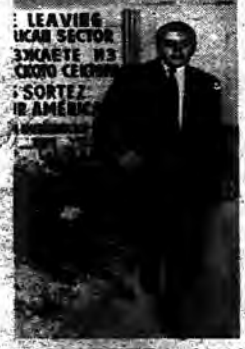
ERNEST BORGNIINE is shown in a scene from "Man on a String" suspended. Columbia spy thriller with Kerwin Mathews co-starred now playing at Century's Shore Theatre in Huntington.