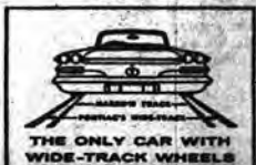
THE ONLY CAR WITH WIDE-TRACK WHEELS

The reason is this: The track (not the body) is wider than any other car. The result is astonishing. You corner more securely, cruise with more confidence, hold a truer course in traffic. The best way, in fact, to measure Pontiac's Wide-Track Wheels is from the driver's seat. Put yourself in this remarkable position soon.