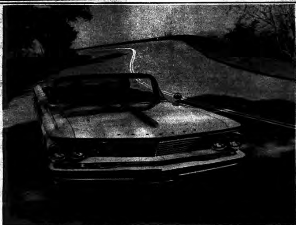
JOIN THE CIRCLE OF SAFETY . . . CHECK YOUR CAR . . . CHECK YOUR DRIVING . . . CHECK ACCIDENTS!