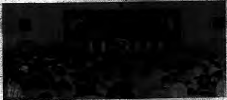
U.S. ARMY FIELD BAND presented a superior performance in Hicksville High School Auditorium last week as a climax of a busy week for the Hicksville School Recreation depart-

ment during the spring vacation. Highlights of the band performance included a special drum presentation and the signing of the Four Bach-stors.