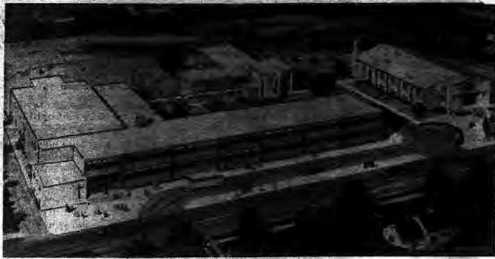
OUR LADY OF MERCY SCHOOL and Convent on South Oyster Bay Road, Hicksville, will look like this when completed. A building fund for a minimum goal of $500,000 was inaugurated this week with Bishop Kellenberg presiding at a solemn opening, Tuesday, during which he blessed the campaign workers. More