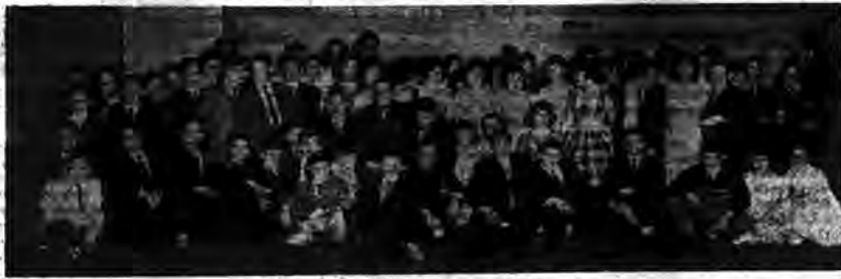
SOME OF THE YOUNGSTERS appearing at the last Youth Group dance of the Birchwood Civic Assoc. The next dance will be a Square and Rock-and-Roll