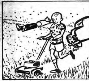
.. Called ...