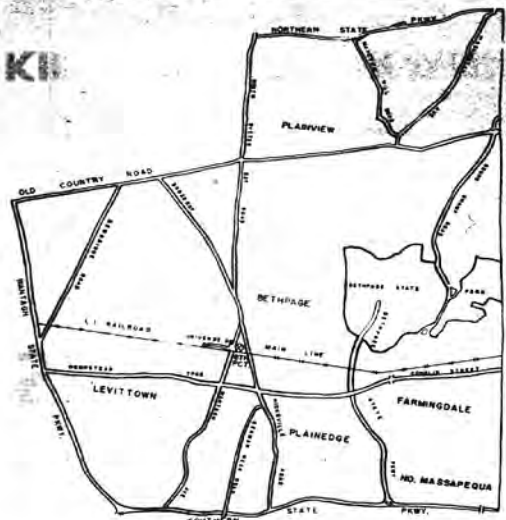
MAP OF EIGHTH PRECINCT AREA: Boundary starts at the northwest, at a point where Wantagh State Parkway intersects Old Country Road, goes east on Old Country Road to South Oyster Bay Road, north to Northern State Parkway, east to Suffolk County Line, south on the county line to Southern State Parkway, west of Wantagh State Parkway, then north to Old Country Rd. Precinct stationhouse is located at 286 Wantagh Ave., Bethpage, and the telephone number is Overbrook 1-8800.