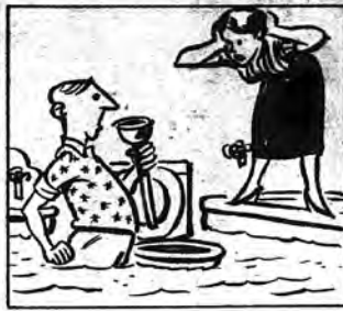
Should Have ...