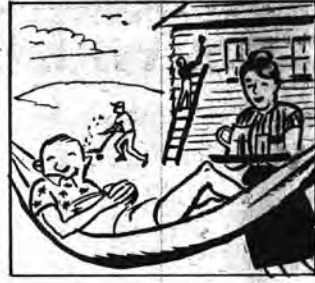
.. CHC Sooner!"