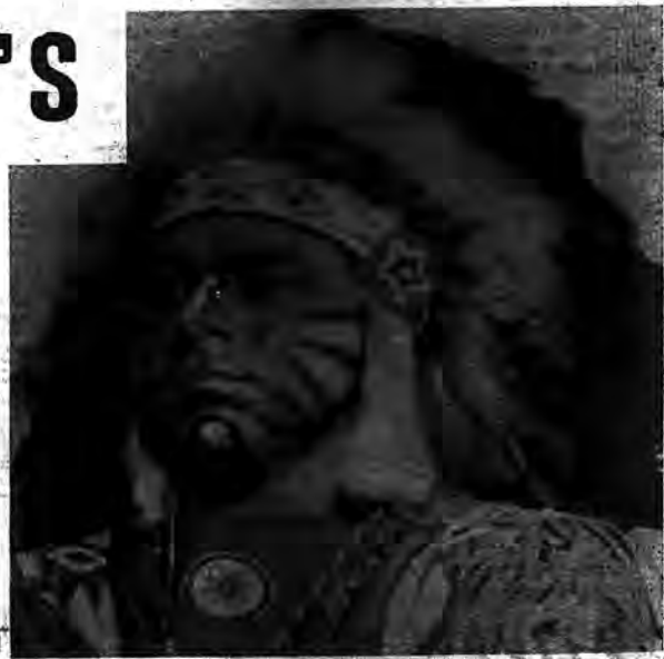
CHIEF FEATHERMAN who will appear along with HOWDY DOODY'S PALS!

On Saturday, March 26th, HOWDY DOODY'S PALS will give three (3) FREE SHOWS at the Mid-Island Shopping Plaza, Hicksville. The first will be at 10:30 AM, one at 1:45 PM and one at 3:45 PM. Each show lasts for 45 minutes and includes such stars as CLARABELL, ZIPPY, BUFFALO VIC, CHIEF FEATHERMAN and others that kids watch every week on 139 NBC-TV Stations.