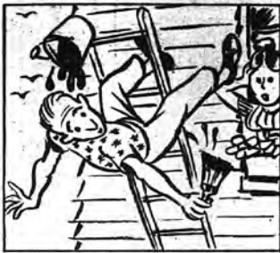
"I Guess I...