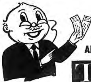
Mr. "Meadow Brook"

INSIDE — OUT EMERGENCY REPAIRS—MAINTENANCE IMPROVEMENTS—PROMPT—REASONABLE Licensed & Bonded Phone: WALnut 1-5217