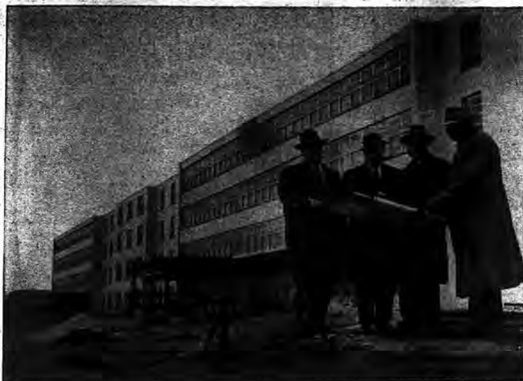
NEW HOME FOR THE AGED —The first of four modern buildings specially designed for older people at the Nassau County Home for the Aged at Uniondale will be opened this year. Two more duplicate buildings will be put under construction in one contract this spring. Inspecting the first unit and future plans