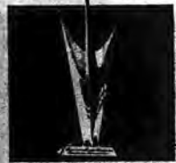
The International Fashion Council, leading fashion authority representing 21 nations, recently presented this Award for Outstanding Design to the 1960 Pontiac.

Have you felt, all along, a keen respect for the Wide-Track Pontiac's clean-cut beauty? World fashion authorities agree! The International Fashion Council has just presented its 1960 Award for Outstanding Design to Pontiac! Shouldn't one of these eye-catching, road-holding cars belong to you?