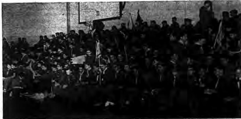
SOME OF THE BOY SCOUTS present at Hicksville Junior High School last Saturday when a rally was staged by Arrowhead District as an event for the Golden Jubilee of Scouting. These

A teenage dance sponsored by the Sodality of Our Lady and the Squires of St. Ignatius Loyola R.C. Church will be held in the school on Sunday evening, Feb. 21, 8 to 11 p.m. Admission will be $1. drag, and 75¢ stag. Boys must wear suits.